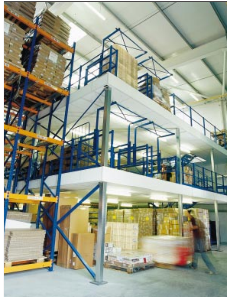
Two-tier mezzanine floor