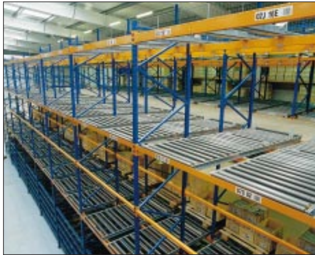
Pallet live racking for larger items