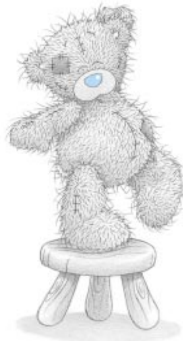
Carte Blanche's world famous 'Me to You' bear.